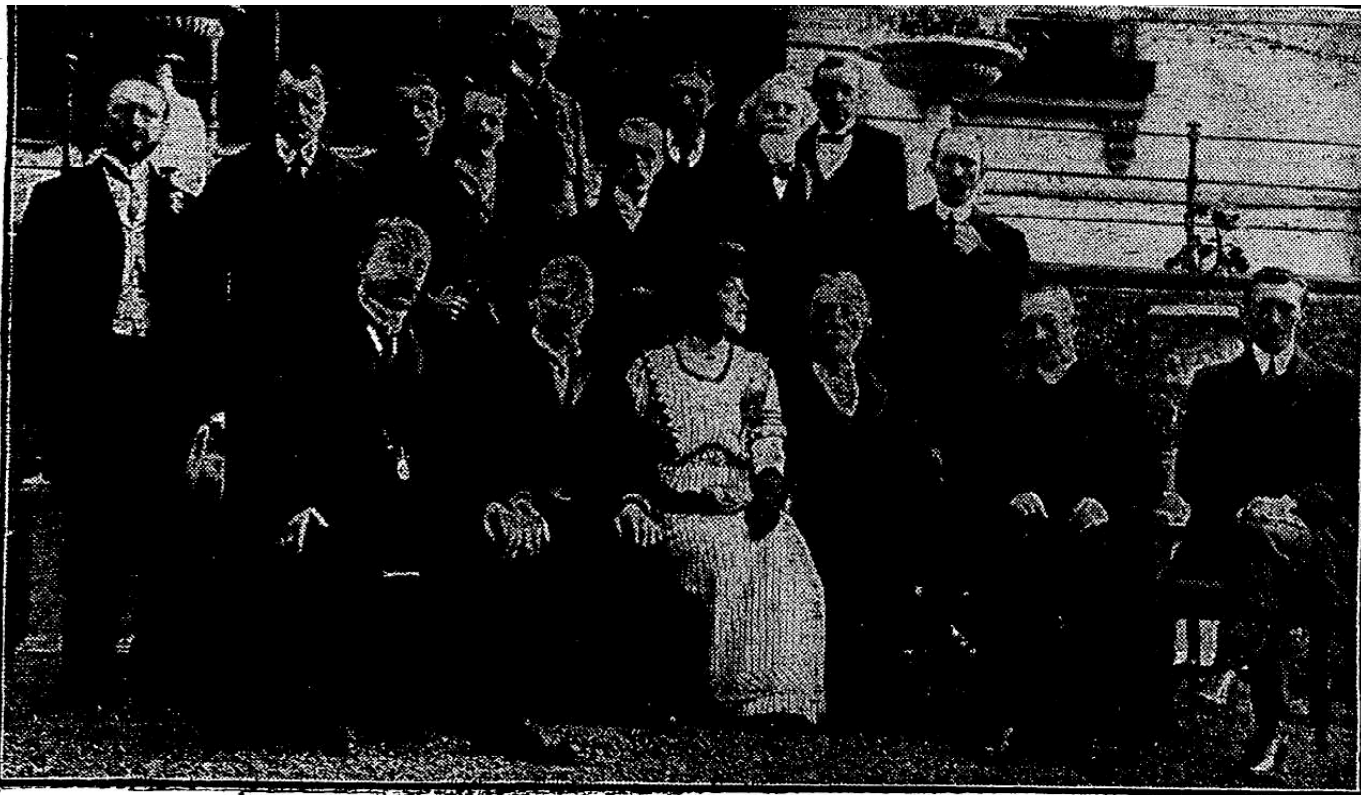
Picture 1: Vacant Land Cultivation Society, 1910 outside mansion house Dublin, The Irish Times (1910) July 16, p13.

Dawson (1913) revealed the plight of Dublin's poor in his report the Inquiry into the Housing Conditions of the Working Classes in the City of Dublin . This report presented the local government with an accurate picture of 20 th century Dublin, wherein evidence showed that the city contained 5,322 tenement houses with 35,227 rooms occupied by 25,822 families consisting of 87,305 persons in total; resulting in an average of 4.8 families or 16.4 persons per house.