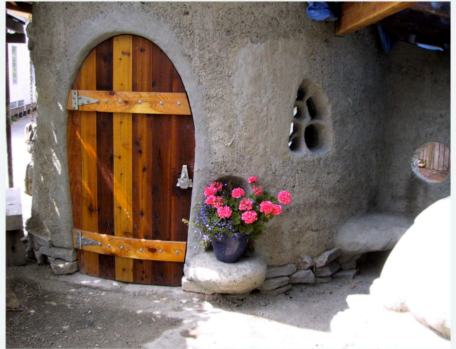
Green buildings. Our cob tool shed is made from clay, sand and straw.