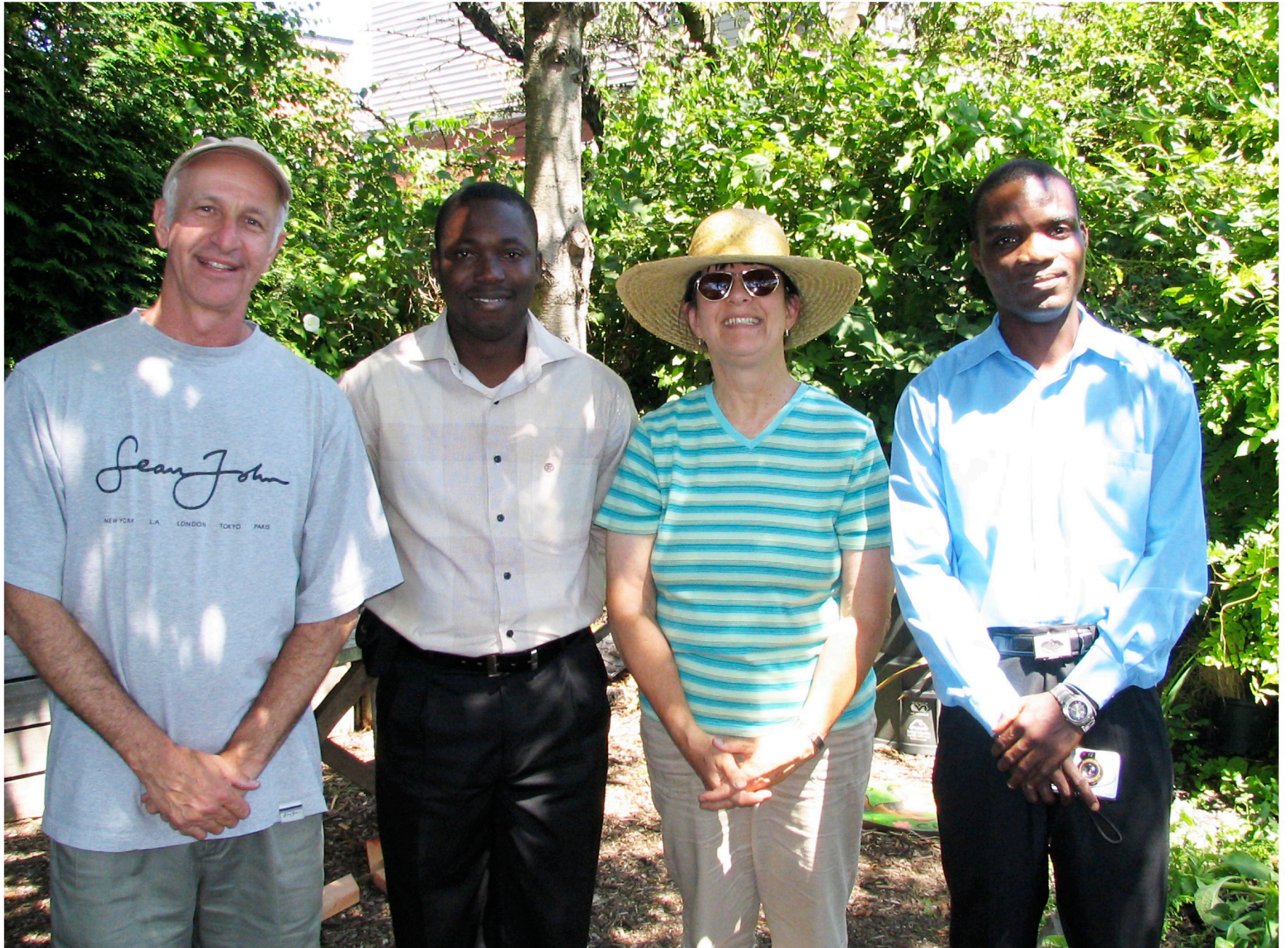
People from around the world visit us and take home 'green' ideas to use in their countries.