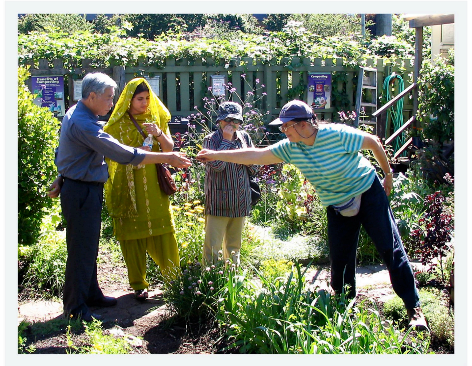
'Hands on' learning takes place every day of the week at the Vancouver Compost Garden.