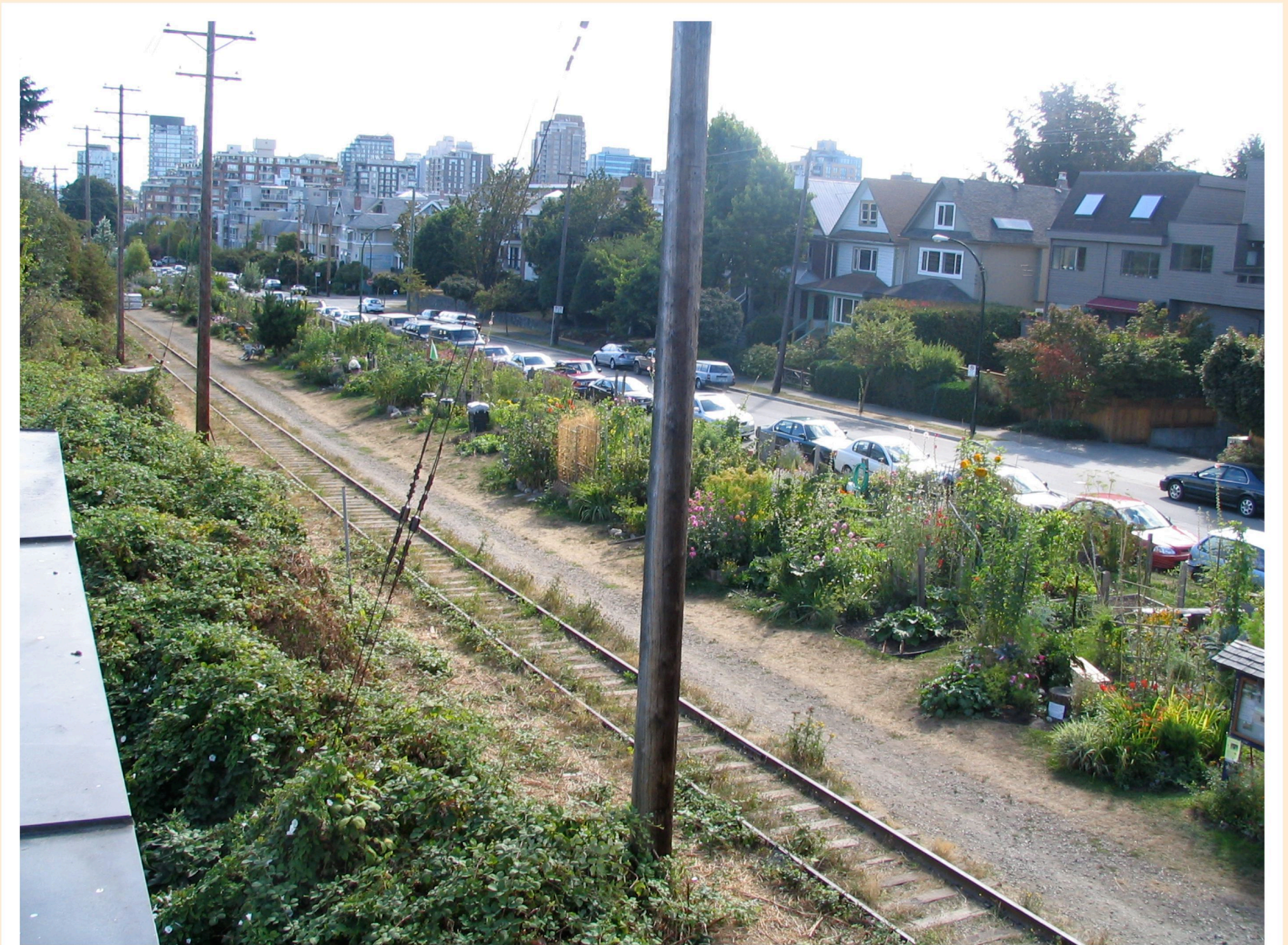
A tour of the Compost Garden includes a visit to four community gardens right next to us on Maple Street.