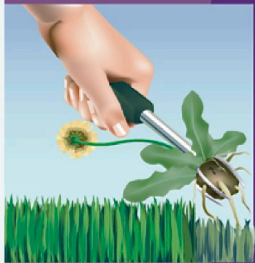
Hand pull weeds