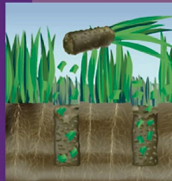
Aerate an overseed compacted soil