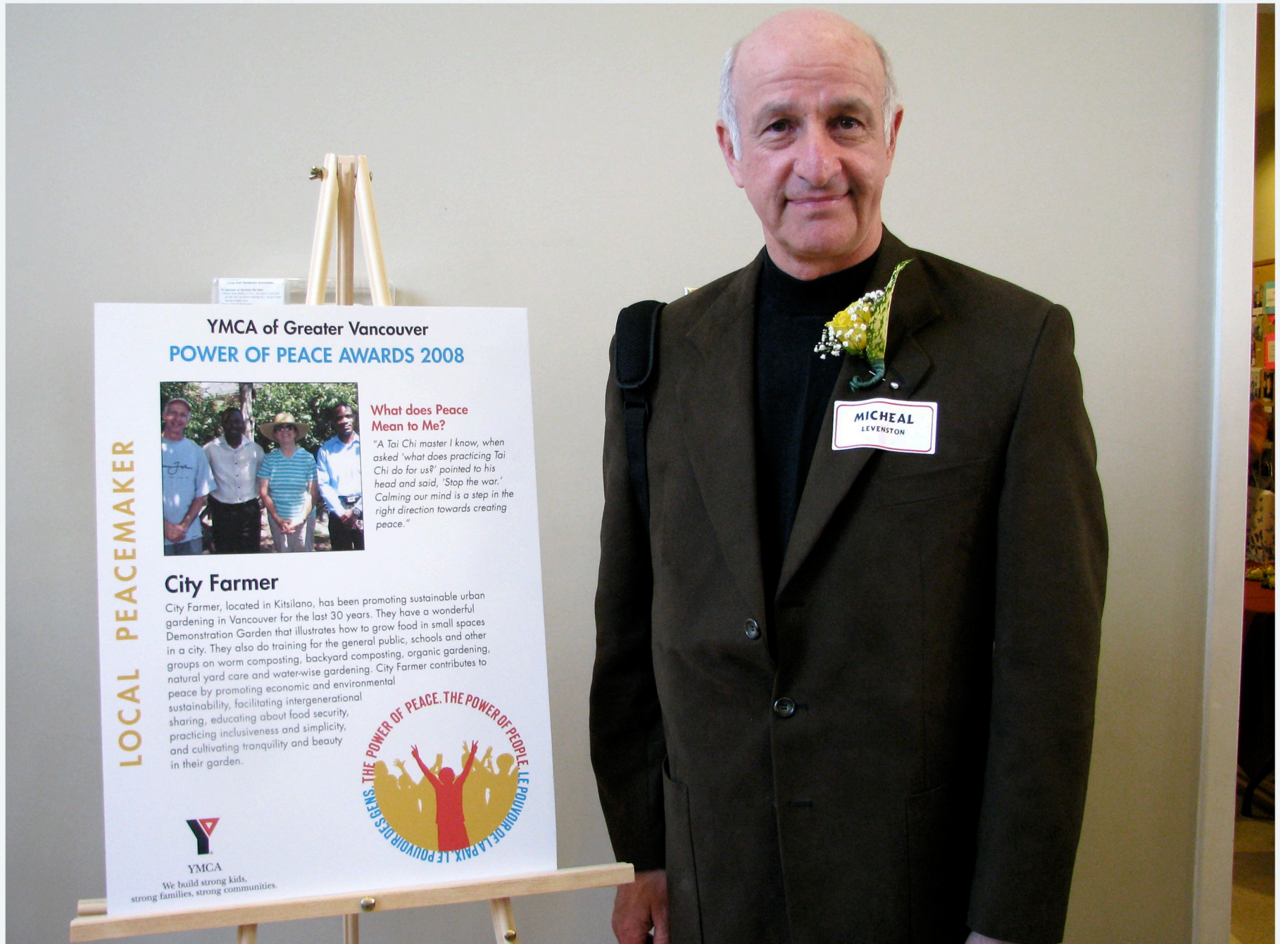
City Farmer is often recognized for its public service work.