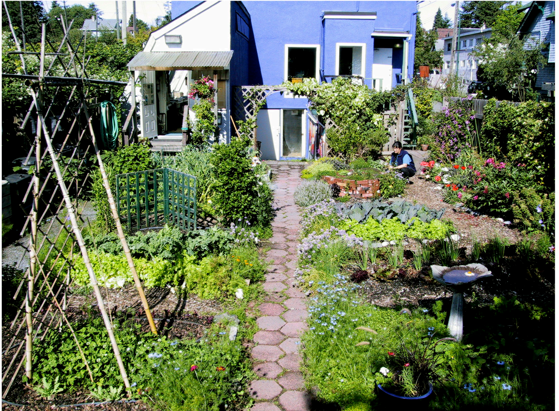
For over 25 years, food has been grown using organic methods at the Vancouver Compost Garden.