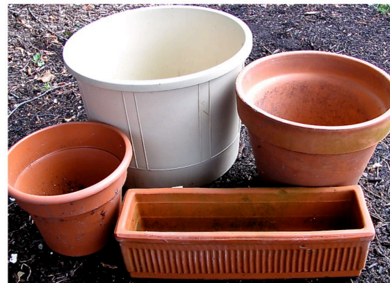
We teach raised bed and container gardening to people with disabilities.