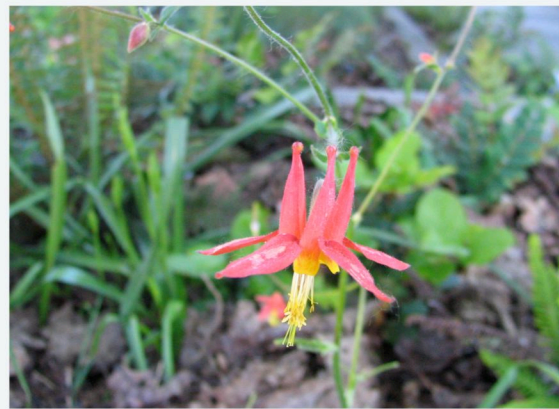
Our Water-Wise Garden features BC native plants, which thrive in wet winters and dry summers.