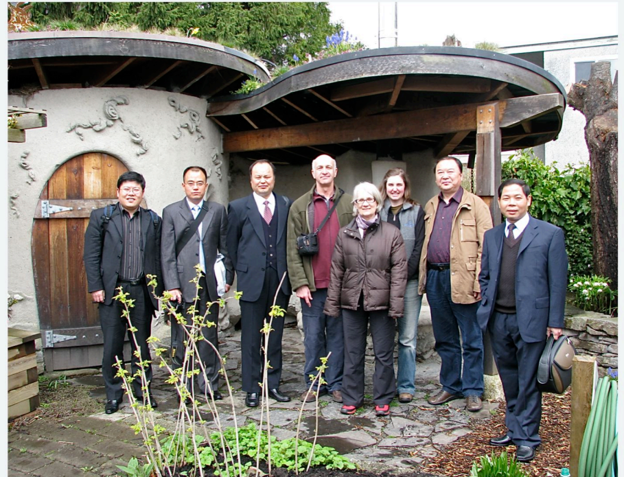
Tours take place every day of the year at the City's Compost Demonstration Garden. Students (left). Mayors from China (right).