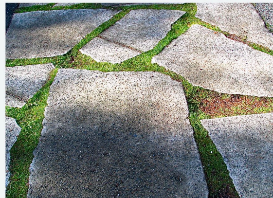
One of the City's three green 'permeable' lanes leads to the Vancouver Compost Garden.