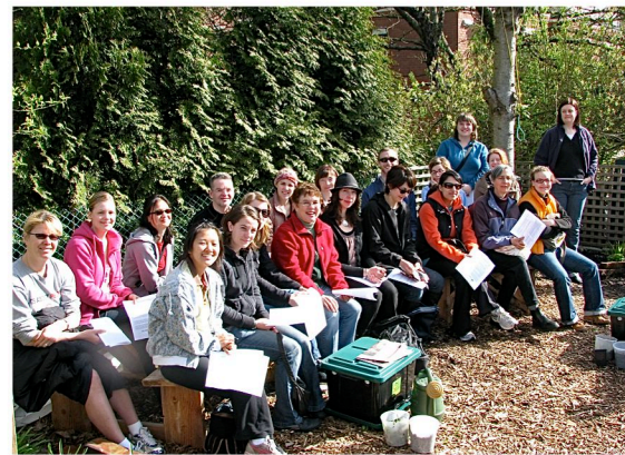
600 Vancouver residents joined our 'wormshops' at the Compost Garden in 2008.