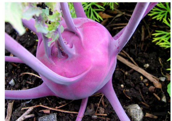
The organic vegetables, herbs, and fruit we grow, go to a local hospice.