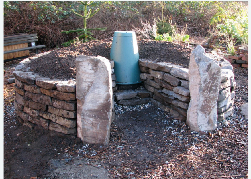
We demonstrate many useful technologies. (clockwise) Wall garden, indoor aeroponics kit, keyhole garden with compost digester, cold frame .