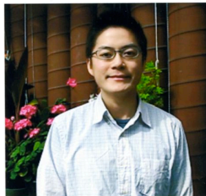
Cantonese-speaking video star – "Patrick".

The Compost Hotline 604.736-2250 is funded by the City of Vancouver and Metro Vancouver