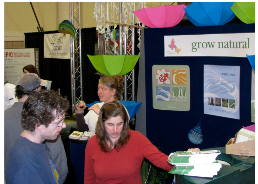
The Compost Hotline reaches people by phone. We speak to thousands more at outreach events.