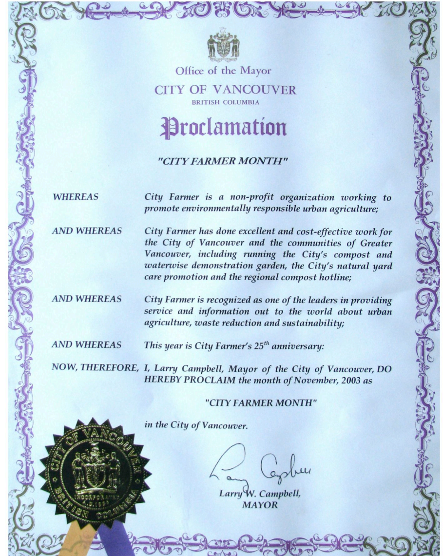
Mayor Larry Campbell proclaims "City Farmer Month" in 2003.