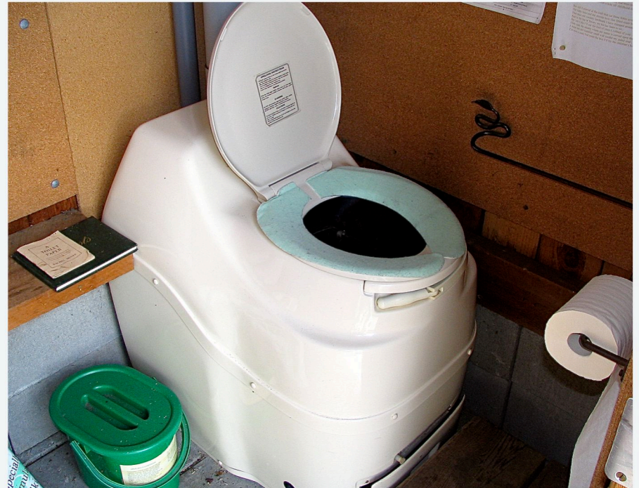
We experiment with other types of waste recycling. A home-made dog waste composter (left). A compost toilet made in Canada (right).