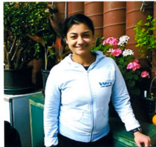
Punjabi-speaking video star – "Preet".