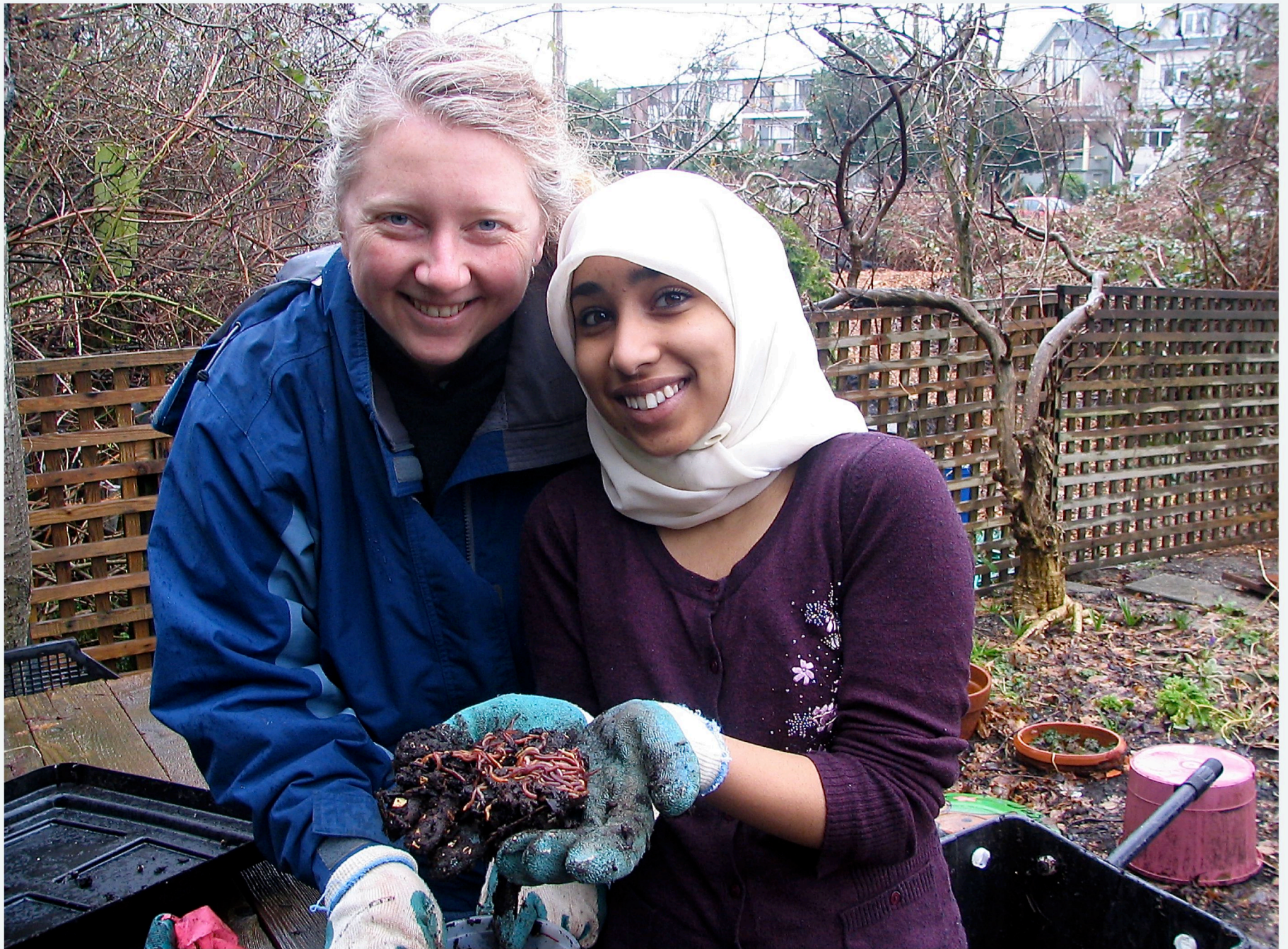
City Farmer and the City of Vancouver run the largest municipal worm bin distribution program in the world!