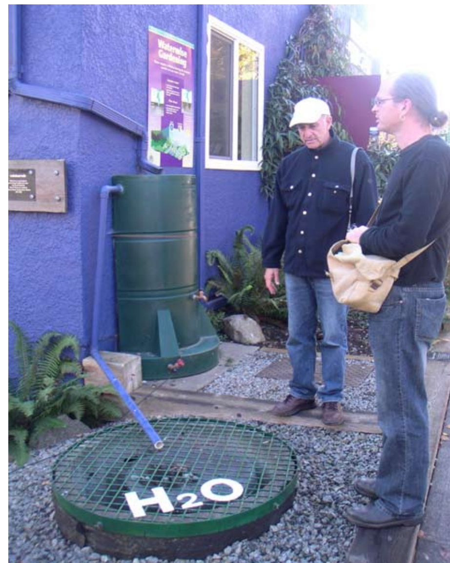
GREY WATER CONSERVATION - RAIN BARREL