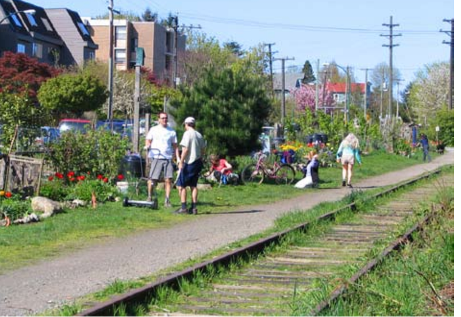
MAPLE COMMUNITY GARDEN, GREENWAY ALONG TRACKS