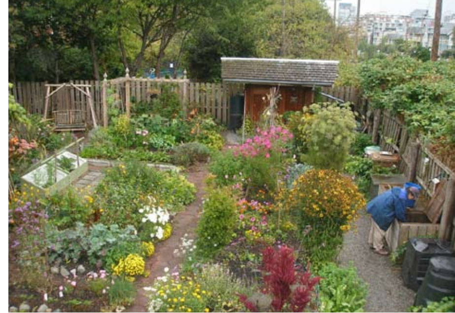
COMPOST DEMONSTRATION GARDEN

A SUSTAINABLE NEIGHBOURHOOD ADJACENT TO CITY FARMER'S DEMONSTRATION GARDEN