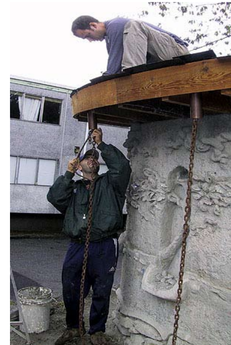
4. HANG DOWNSPOUTS'