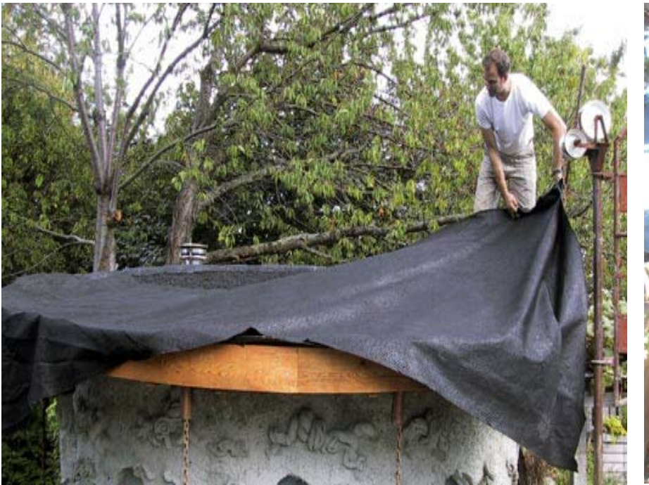
6. SPREAD OUT LANDSCAPE FABRIC