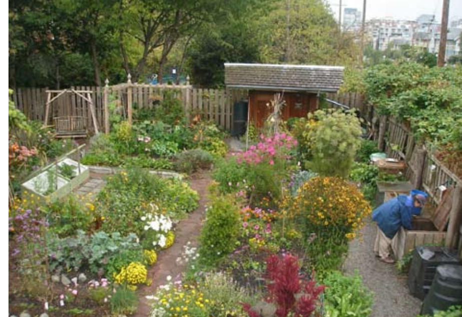
COMPOST DEMONSTRATION GARDEN

A SUSTAINABLE NEIGHBOURHOOD ADJACENT TO CITY FARMER'S DEMONSTRATION GARDEN