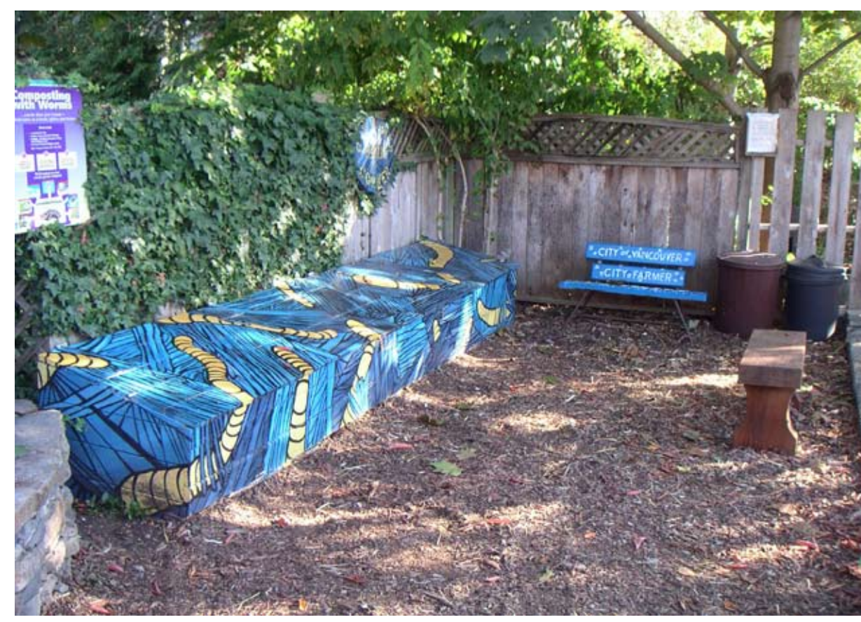
CITY FARMER - WORM BIN, FOR COMPOSTING