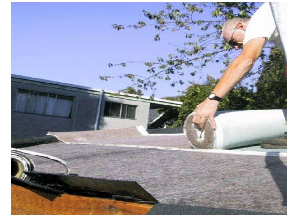
3. APPLY "ROCKWALL" ON TOP OF TWO LAYERS OF ROOFING MEMBRANES