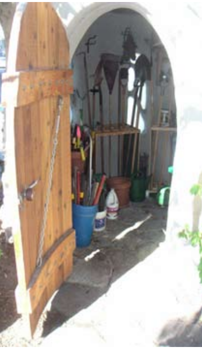
THE TOOL SHED