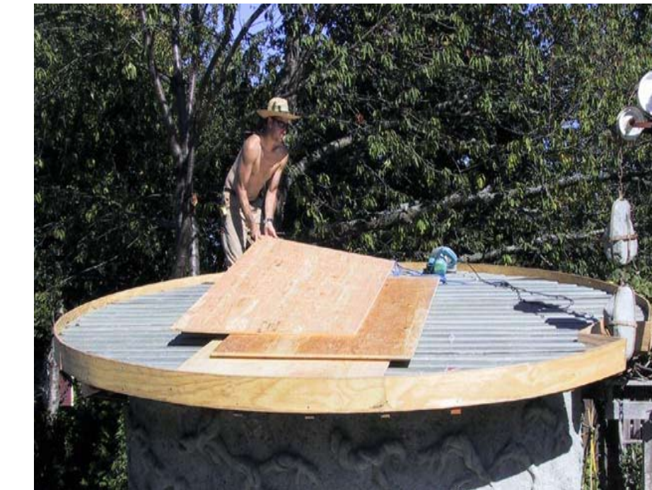
2. PLACE PLYWOODS ON METAL SHEETS