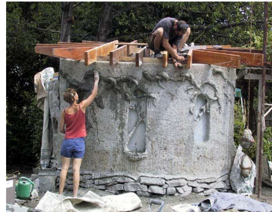
1. PLACE RAFTERS AND SCULPT THE WALL