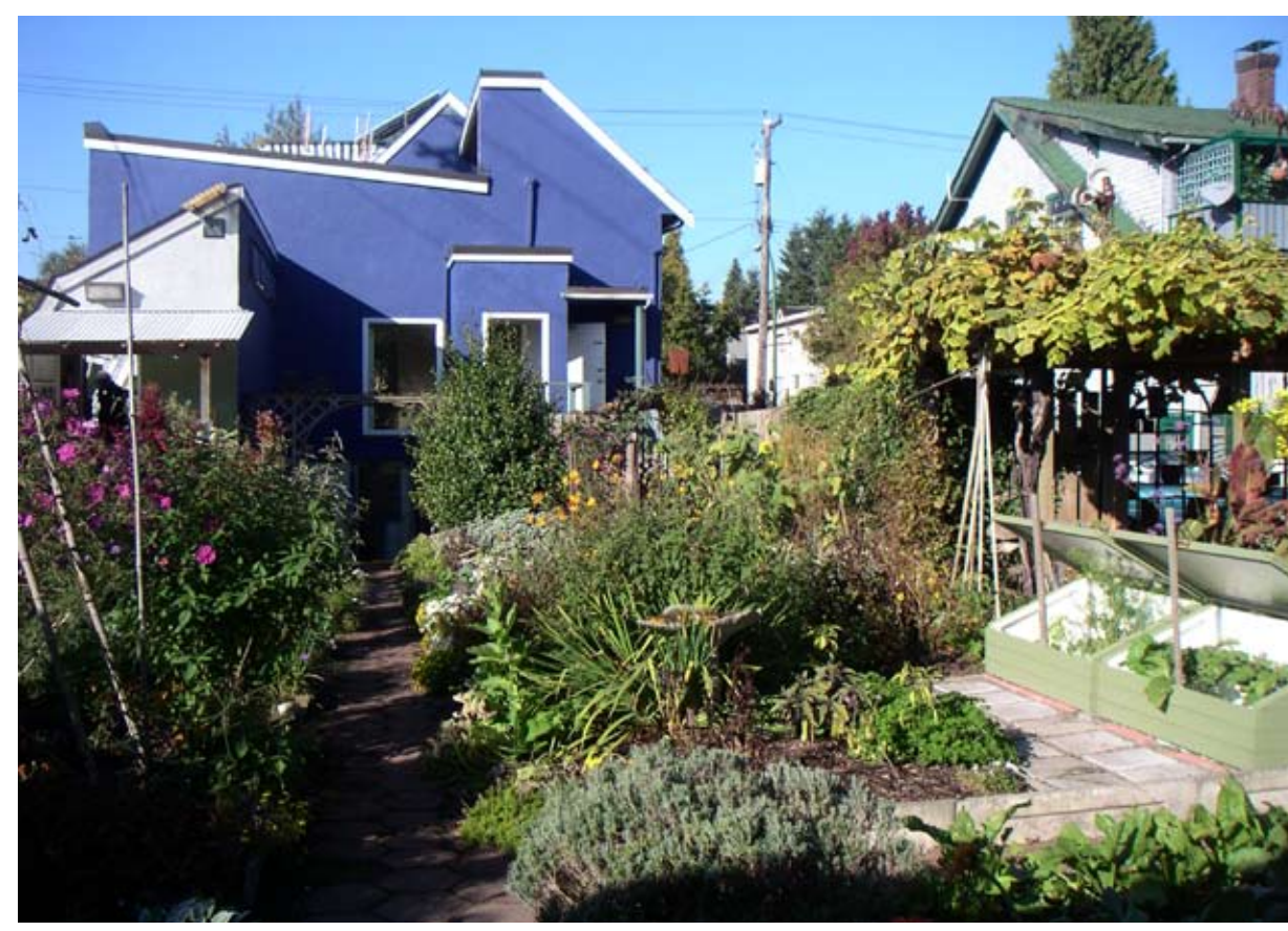
CITY FARMER - DEMONSTRATION FOOD GARDEN