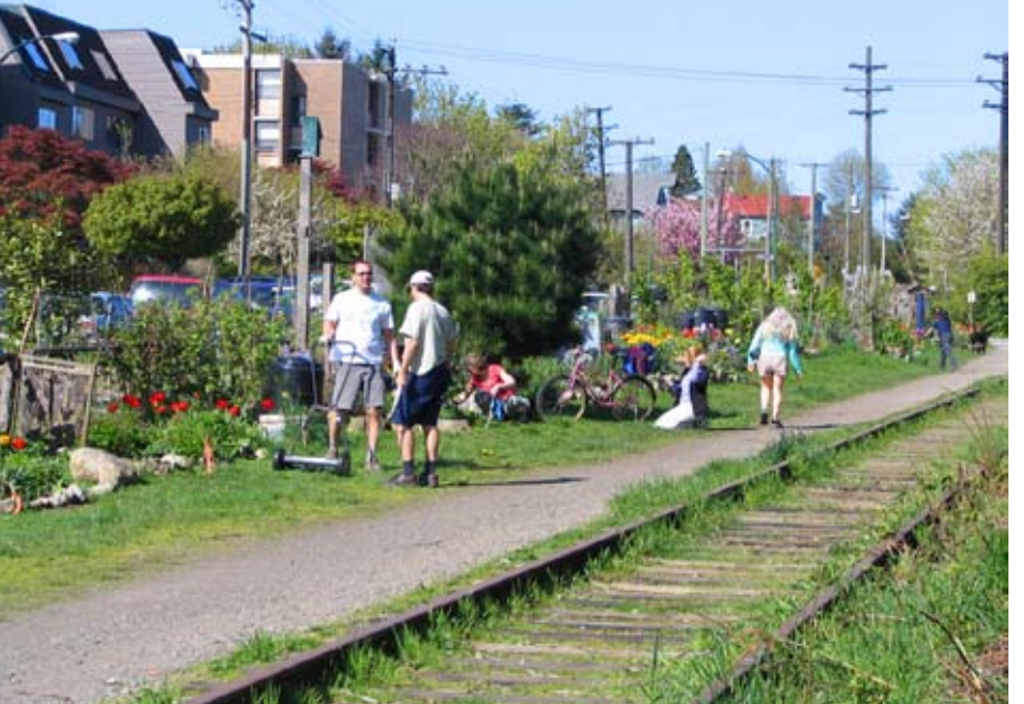
MAPLE COMMUNITY GARDEN, GREENWAY ALONG TRACKS