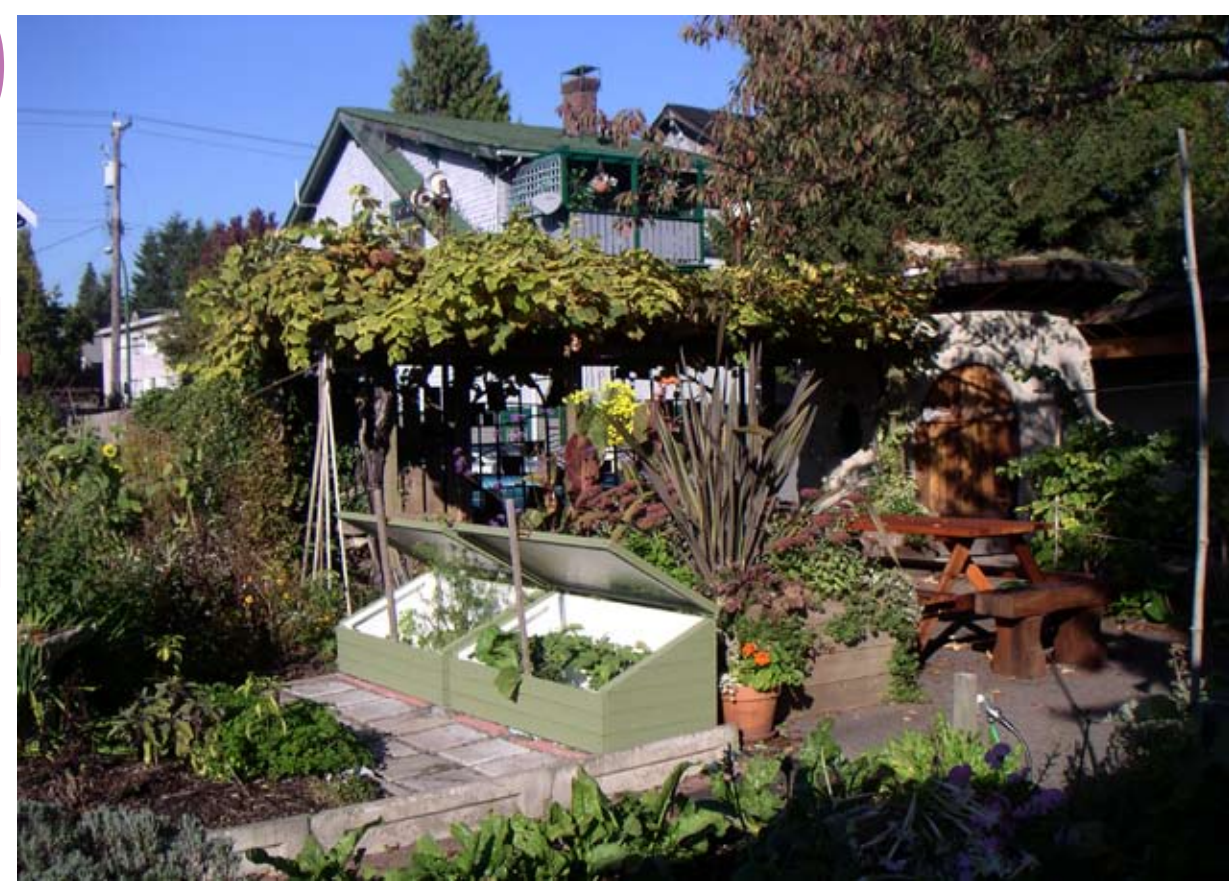
CITY FARMER - DEMONSTRATION FOOD GARDEN