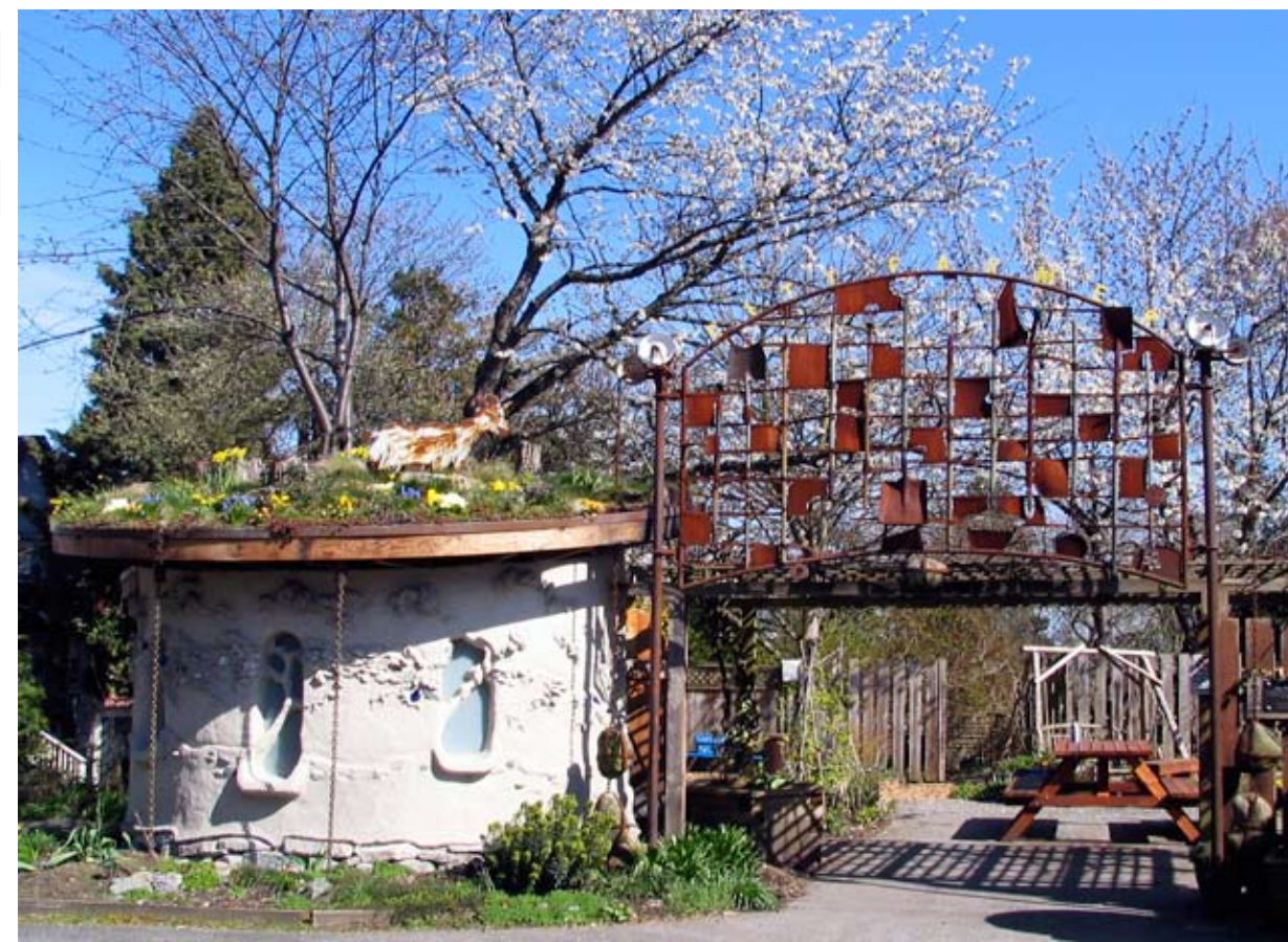
CITY FARMER - COB SHED