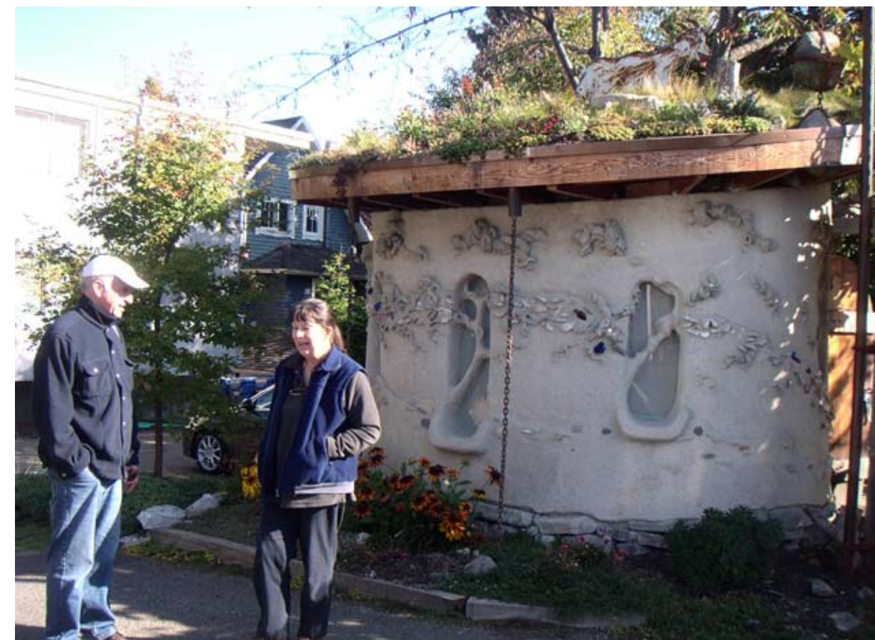
CITY FARMER - COB SHED