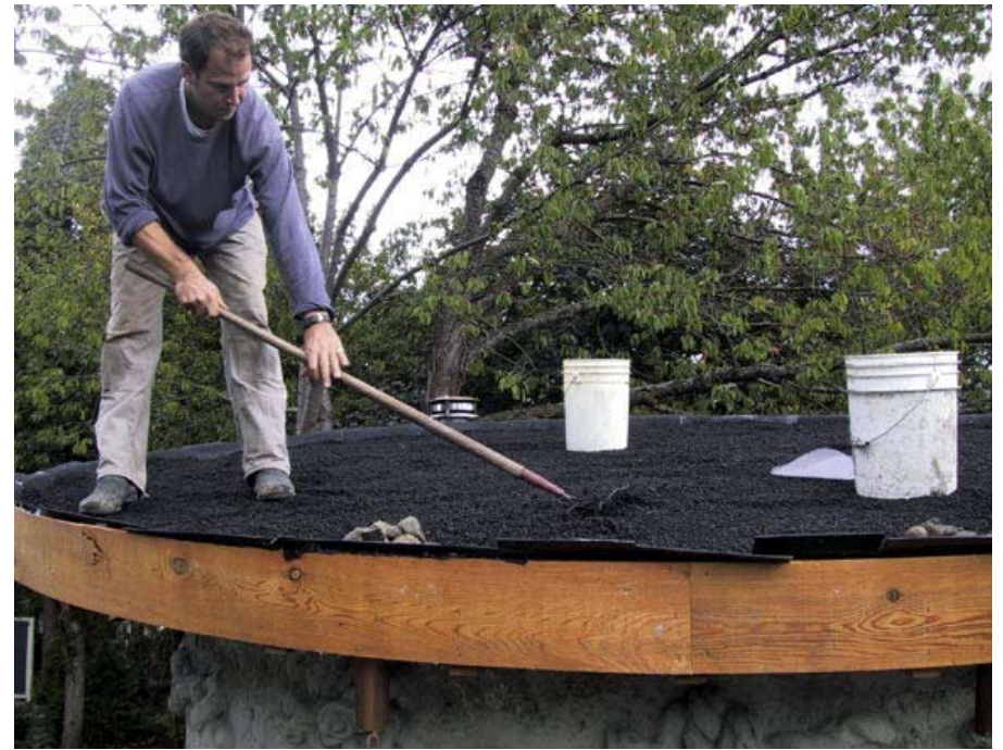
5. LEVEL LANDSCAPE PUMICE WITH RAKE