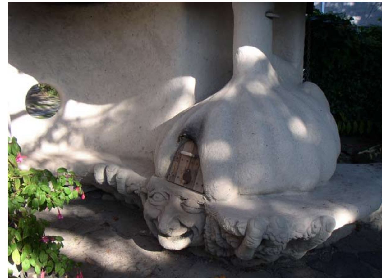
CITY FARMER - COB OVEN